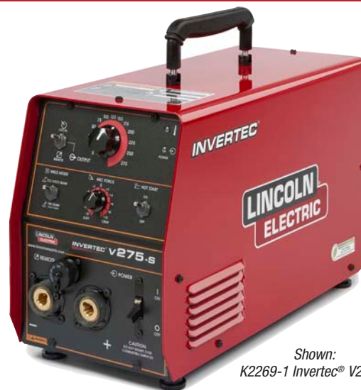
Shown: K2269-1 Invertec® V275-S